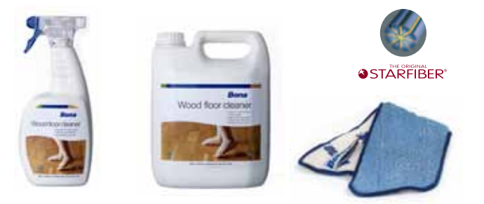
Available in a 1-litre spray bottle as well as a 4-litre refill. Use together with the Bona Cleaning Pad in microfibre.